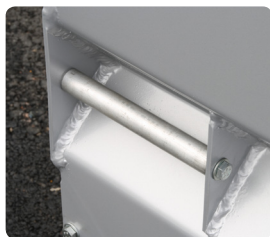
Lifting and lashing brackets on all four sides.