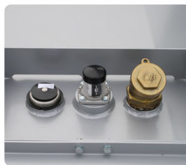
2" analogue level sensor, 2" tank cap, 1" over-pressure/vacuum valve.