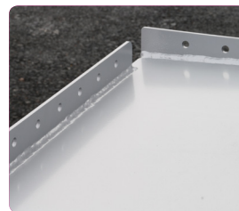
Upper rim with fixing brackets for refuelling hose and diesel handle holder.