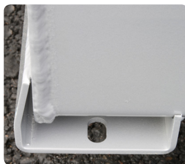
Protective feet with fixing brackets for the platform.